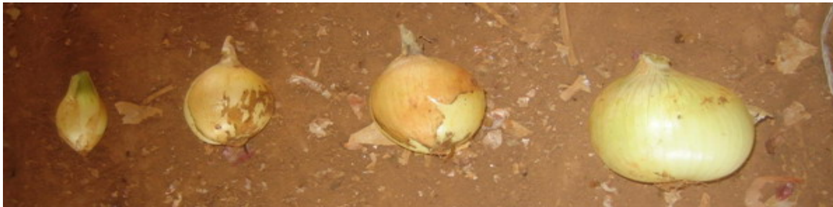
TYPE 1 (small)

Onions are classified according to the bulb size into the following categories: Type 01 – small, Type 02 – medium, Type 03 – large and Type 04 – extra large. The financial effect on the producer depends directly on the representation of individual categories within the structure of the entire yield, particularly Type 03, which is the most valued one.