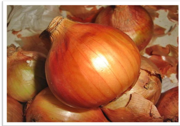
( Allium cepa )